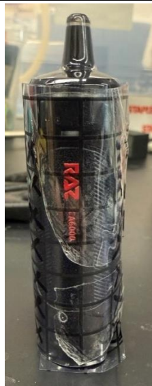
Right side view