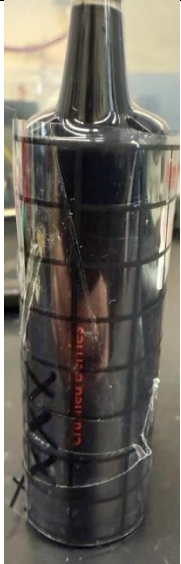
Left side view